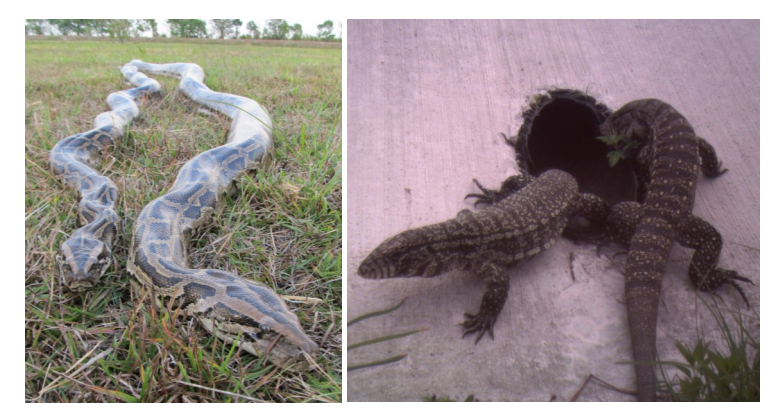
Figure 3. The Burmese python (Python molurus bivittatus, left) and Argentine black and white tequ (Salvator merianae, right) already have established populations in Florida. These predators threaten native wildlife and have the potential to disrupt entire ecological communities.