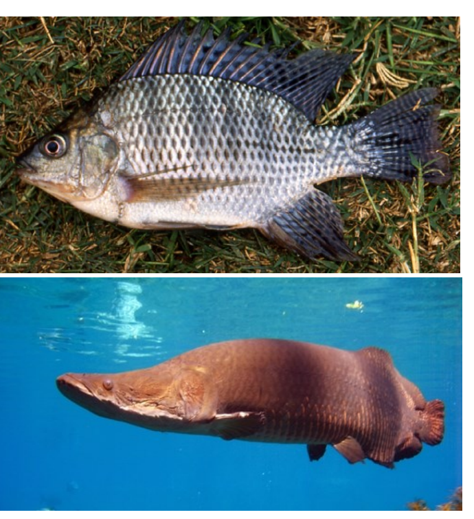
Figure 5. The Fish Invasiveness Screening Kit (FISK) has been used to identify high-risk fish species in Florida such as the Nile tilapia (Oreochromis niloticus, top) and Arapaima (Arapaima gigas, bottom).

The University of Florida and partner agencies are planning to develop a Florida Reptile Invasiveness Screening Kit (RISK). RISK will incorporate biological profiles of select nonnative reptile species in a framework that considers all phases of invasion: arrival, establishment, spread, persistence, and impact. Questionnaire results will be combined with climate matching data and species' estimated geographic range to categorize nonnative reptile species as low, intermediate, or high risk. Results will help prevent further introductions of invasive reptiles into Florida, develop early detection and rapid response strategies, and provide a model for invasive reptile risk assessments elsewhere.