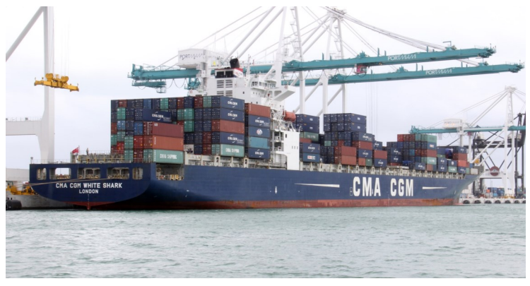
Figure 2. Millions of live animals enter the United States through Florida ports, like the Port of Miami.

Risk assessment can be applied at various stages of the invasion process, most notably prevention and eradication (Figure 1). In the prevention phase, risk assessment is essential to develop screening procedures and regulate importation. After species are introduced, risk assessment remains critical to identify priority species for early detection and rapid response (EDRR). This fact sheet focuses on the development of risk screening tools for both prevention and EDRR.