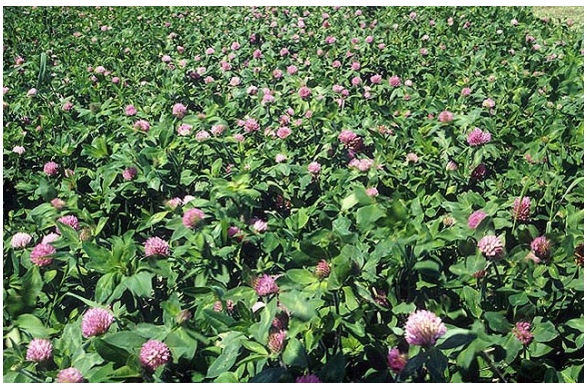
R.R. Smith, USDA

Age at reproductive maturity Adult body size Maximum longevity Fecundity Clutch size Generation time Level of parental care Possibility of parthenogenesis/sperm storage Competitiveness/gregariousness Dietary breadth Vulnerability to predation Venomousness