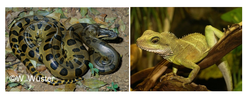
Figure 4. The green anaconda ( Eunectes murinus , left) and Chinese water dragon ( Physignathus cocincinus , right) have been found in the wild in Florida, but with no evidence of breeding. If they establish, these species could have severe ecological impacts.

• Qualitative risk assessment uses professional judgments to assign species to categories based on biological characteristics and climate information. Experts assign a numerical value for each parameter, then total the scores to categorize species as low, medium, or high risk.