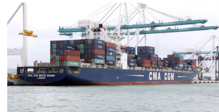
Figure 2. Millions of live animals enter the United States through Florida ports, like the Port of Miami.

Risk assessment can be applied at various stages of the invasion process, most notably prevention and eradication (Figure 1). In the prevention phase, risk assessment is essential to develop screening procedures and regulate importation. After species are introduced, risk assessment remains critical to identify priority species for early detection and rapid response (EDRR). This fact sheet focuses on the development of risk screening tools for both prevention and EDRR.