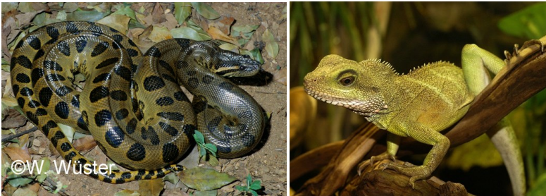
Figure 4. The green anaconda ( Eunectes murinus , left) and Chinese water dragon ( Physignathus cocincinus , right) have been found in the wild in Florida, but with no evidence of breeding. If they establish, these species could have severe ecological impacts.

No single factor adequately predicts a species’ introduction and establishment, and factors vary across taxa and environments. Therefore, all approaches must consider multiple biological and ecological parameters (Table 1). Researchers also should acknowledge any uncertainties in the data and consider the implications of uncertainties for risk estimates (Bartell and Nair 2003).