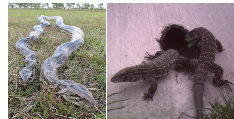
Figure 3. The Burmese python ( Python molurus bivittatus, left) and Argentine black and white tegu ( Salvator merianae, right) already have established populations in Florida. These predators threaten native wildlife and have the potential to disrupt entire ecological communities.