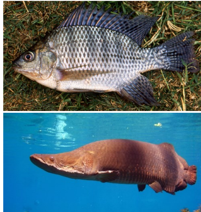
Figure 5. The Fish Invasiveness Screening Kit (FISK) has been used to identify high-risk fish species in Florida such as the Nile tilapia ( Oreochromis niloticus , top) and Arapaima ( Arapaima gigas , bottom).

The University of Florida and partner agencies are planning to develop a Florida Reptile Invasiveness Screening Kit (RISK). RISK will incorporate biological profiles of select nonnative reptile species in a framework that considers all phases of invasion: arrival, establishment, spread, persistence, and impact. Questionnaire results will be combined with climate matching data and species' estimated geographic range to categorize nonnative reptile species as low, intermediate, or high risk. Results will help prevent further introductions of invasive reptiles into Florida, develop early detection and rapid response strategies, and provide a model for invasive reptile risk assessments elsewhere.