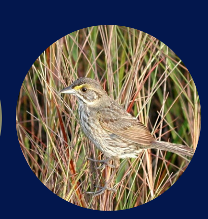
Cape Sable Seaside Sparrow