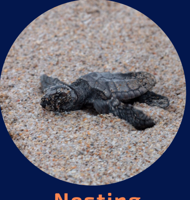
Nesting sea turtles